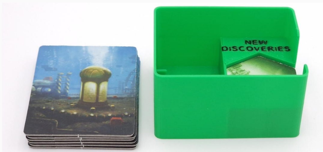
Box for NEW DISCOVERIES expansion components